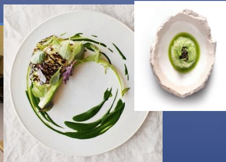
Art of plating