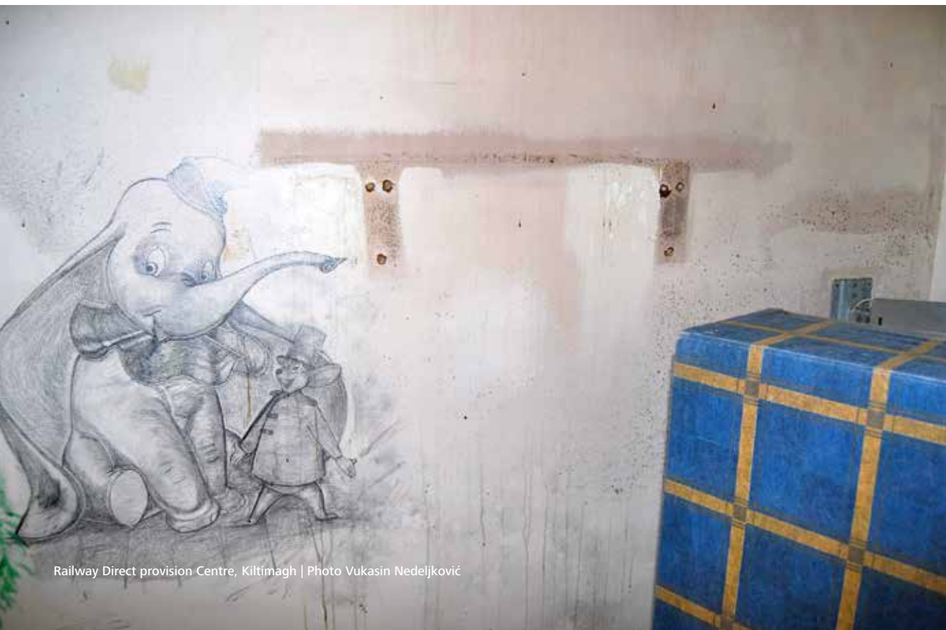
Railway Direct provision Centre, Kiltimagh

The Asylum Archive is on exhibition in the Source Arts Centre in Thurles from 5 to 25 April 2019. www.asylumarchive.com