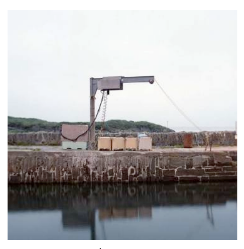
Eóin Ó'Conaill Pier 2010

"The images set out to document the diverse people and landscapes that make up Cape Clear Island, from portraits of native cape clear residents, young people and newcomers to the community, the photographs set out to capture a fresh, new perspective of a unique people and place." Eóin Ó'Conaill